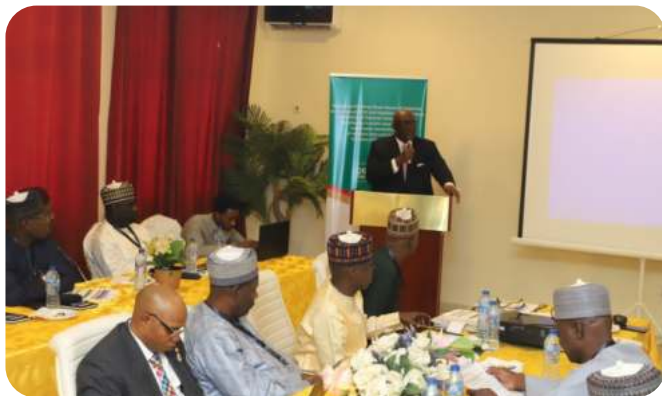
Chief Joe-Kyari Gadzama, SAN addressing members of the Borno State House of Assembly during a workshop at the Palms Hotel Abuja