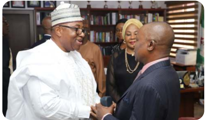
L-R: Fmr Governor of Bauchi State, H.E M. A. Abubakar and Prince Lateef Fagbemi, SAN, Attorney General of the Federation and Hon. Minister of Justice