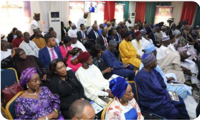
A cross section of guests