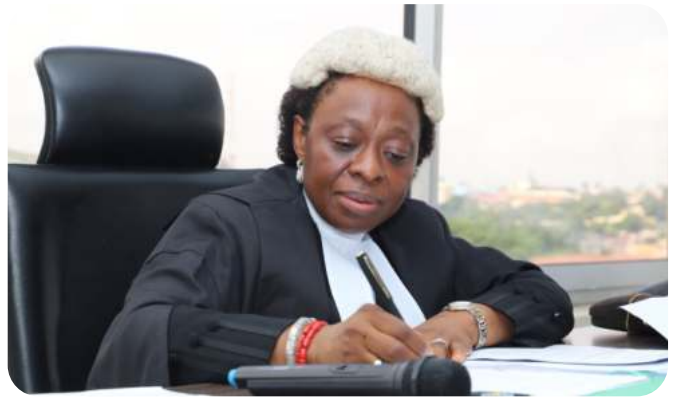
Hon. Justice Rakiya B. Haastруп presiding over the Mock Trial Exercise