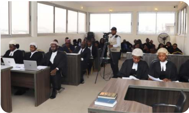
A cross section of the externs and guests

From Mock Trial Exercise for the 2023 Set of Externs from the Nigerian Law School held at the Hon. Justice Niki Tobi, CON (Rtd) Moot Court, J-K Gadzama Court, Abuja on Friday, July 21, 2023