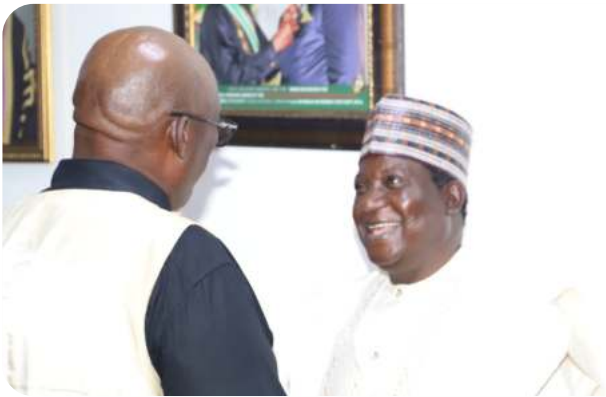
Chief Joe-Kyari Gadzama, SAN and H.E Simon Bako Lalong, Hon. Minister of Labour and Employment